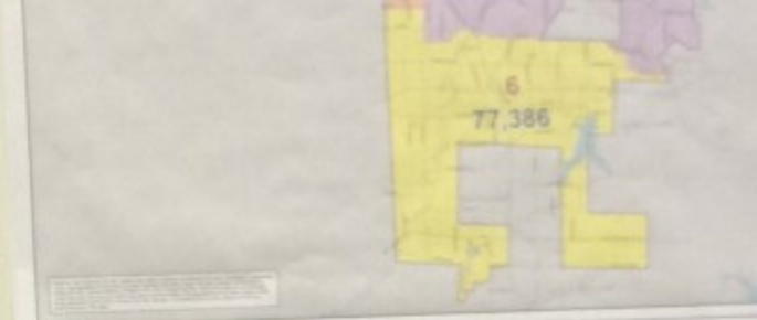
2010 Census Population By City Council District March 1, 2011 Prepared by: City Planning and Development Department City of Kansas City, Missouri