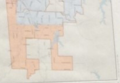
Restricting Draft Scenario 1-REV August 29, 2011