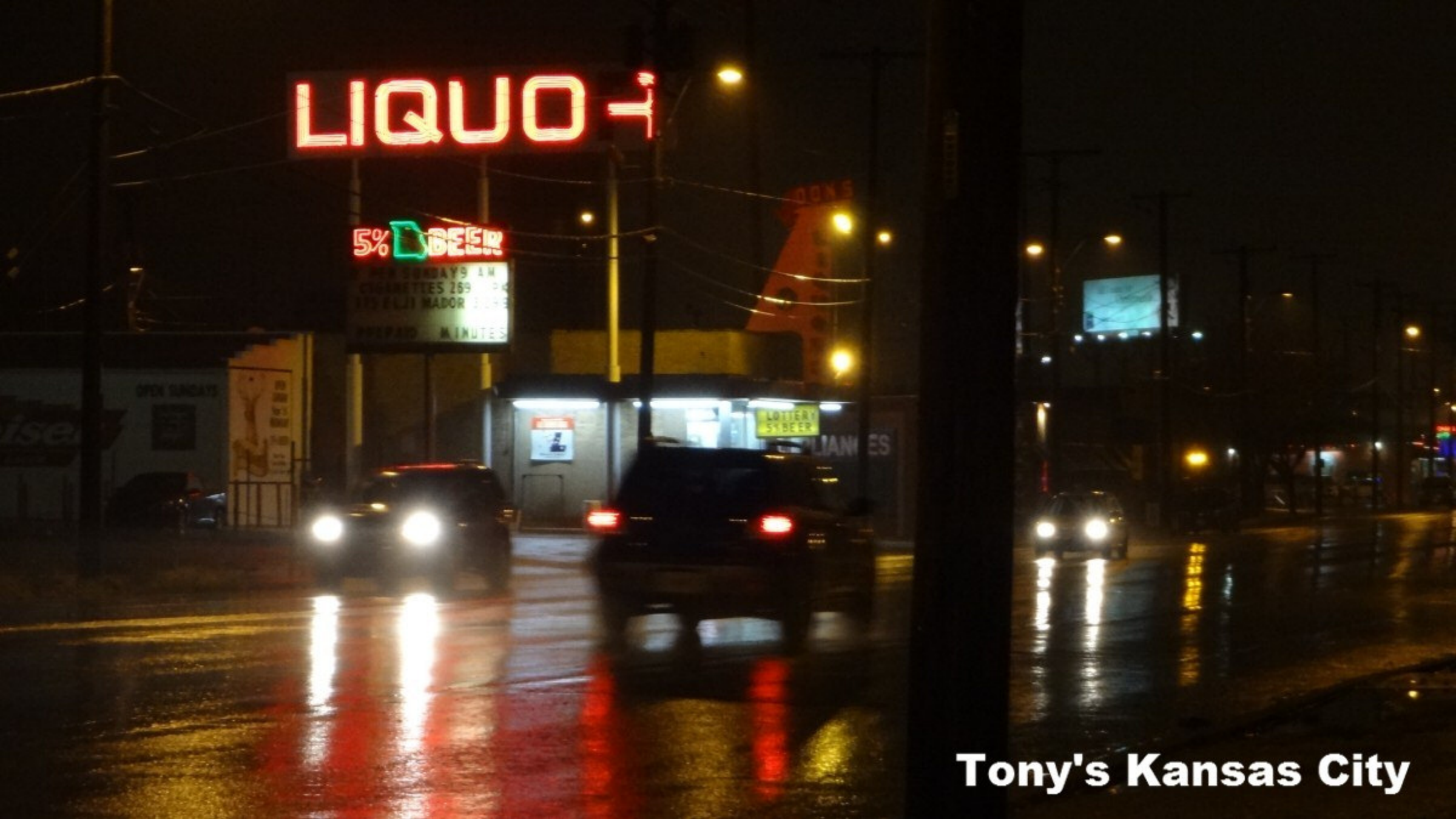
Tony's Kansas City